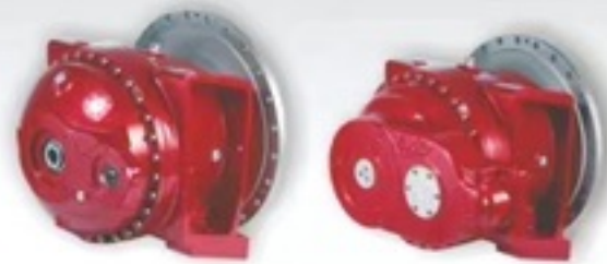
Spare Parts for REDUCER GEARBOX