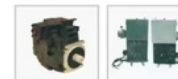
4 Hydraulic Pump 5 Oil Cooler