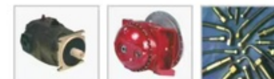
1 Hydraulic Motor 2 Reducer Gearbox 3 Hydraulic Hoses