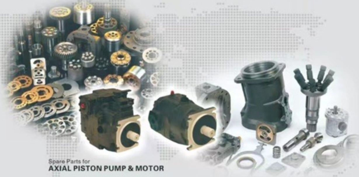
Spare Parts for AXIAL PISTON PUMP & MOTOR